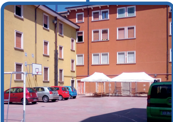
This is the parking Lot

Enter the code 1414E to open the gate. WAIT FOR THE GATE TO BE COMPLETELY OPENED BEFORE ENTERING THE CAR. If the gate remains blocked, the code must be re-entered.