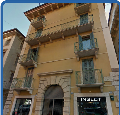
This is your Building

Via Cappello 49 - 37121 Verona Tel: +39 0455116402 - Cell/Whatsapp: Marco +39 348 2732007